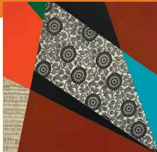
FOLDS work by Billy McCarroll